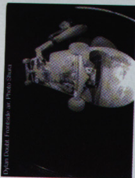
Dylan Doubt: Frontside air.