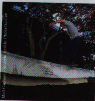
Matt Cadieux: Frontside flipkick.