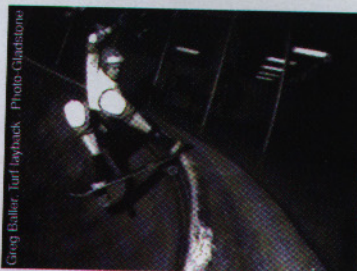
Greg Baller: Surf layback.