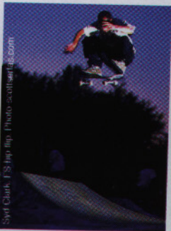
Syrr Clark: FS flip flip.